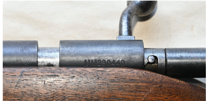
The same rifle with a serial number engraved.