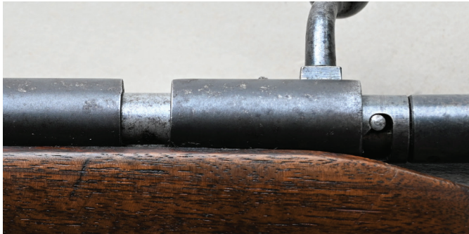
A Remington Targetmaster 510 without a serial number on the receiver.